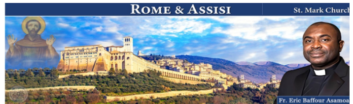
Catholic Church of St. Mark