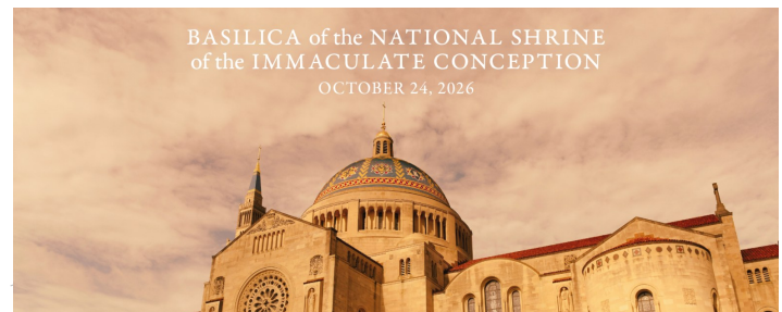
BASILICA of the NATIONAL SHRINE of the IMMACULATE CONCEPTION OCTOBER 24, 2026