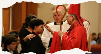
Confirmation Mass Tuesday, May 19 th ~ 7p Prince of Peace, Chesapeake

Please take a moment to pray for the youth of our parish as they prepare to receive the Sacraments of Initiation in the upcoming weeks.