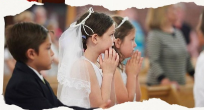
1 st Holy Communion Saturday, May 30 th ~ 1pm